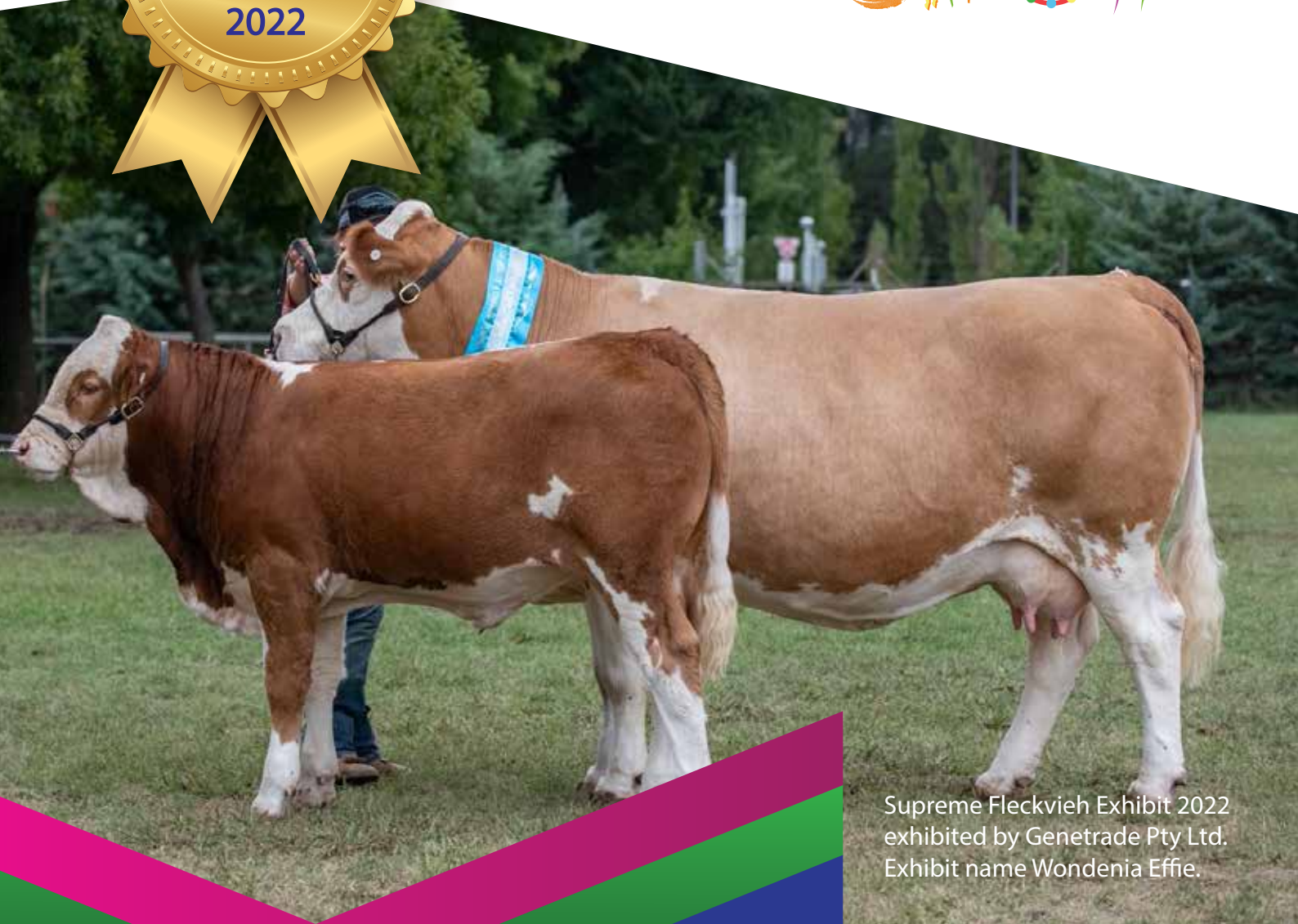
Supreme Fleckvieh Exhibit 2022 exhibited by Genetrade Pty Ltd. Exhibit name Wondenia Effie.